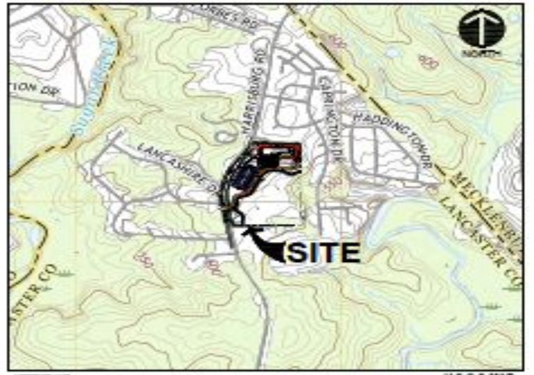
U.S.G.S. MAP SCALE 1"=1000' SCALE IN FEET VICINITY MAP U.S.G.S. 7.5 MIN. TOPOGRAPHIC MAP PORT HILL, PA. QUADRANGLE DATE 2000